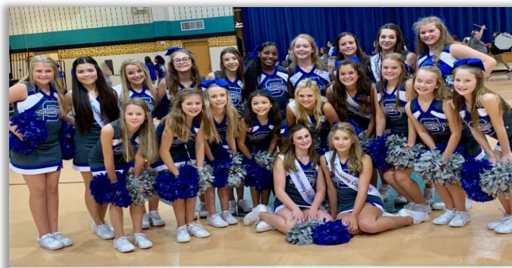
Southside Junior High Cheerleaders at the 2019 Homecoming Pep Rally