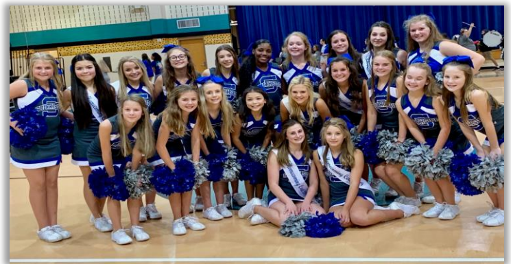
Southside Junior High Cheerleaders at the 2019 Homecoming Pep Rally